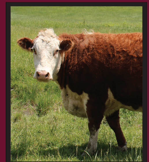
Photos above: Sheep Pasture Flower Stand (top) & Solek Farm (bottom)