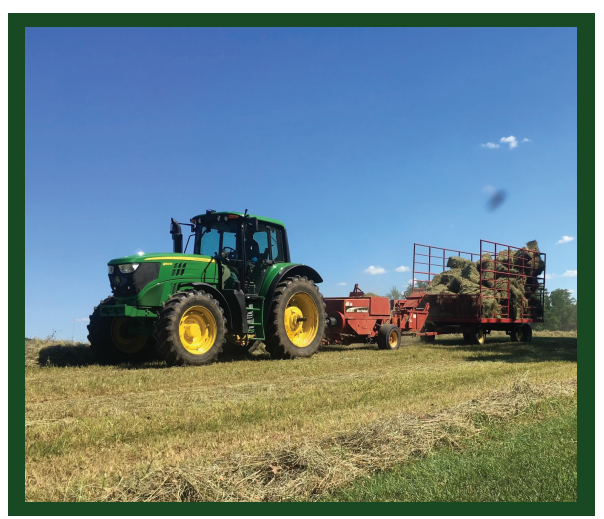
Solek Farms

Farming has been a part of Southwick's history since its incorporation in 1770... and long before!